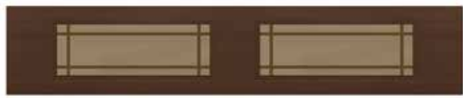
Bronze Reflective Glass & Regal Wide Bronze Muntin Bars