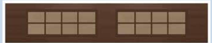
Bronze Reflective Glass & Stanton Wide Bronze Muntin Bars