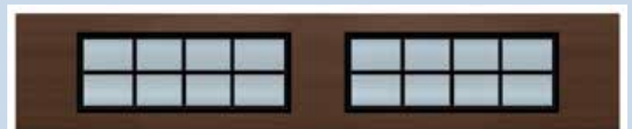
Satin Texture Glass & Stanton Wide Black Muntin Bars