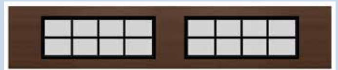
Stanton Wide Black Muntin Bars