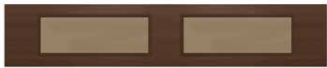
Bronze Reflective Sealed Glass