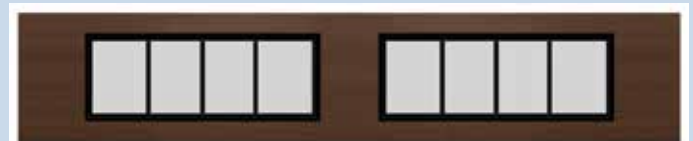
Provincial Wide Black Muntin Bars