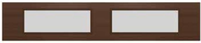
Clear View Sealed Glass