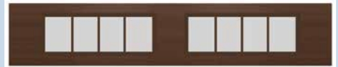
Provincial Wide Bronze Muntin Bars