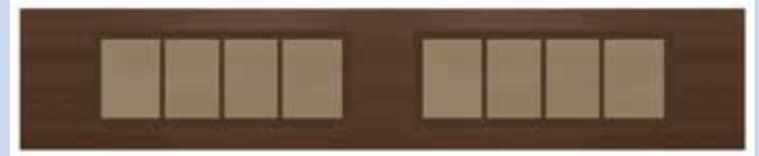
Bronze Reflective Glass & Provincial Wide Bronze Muntin Bars