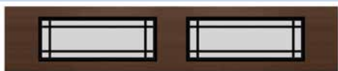
Regal Wide Black Muntin Bars