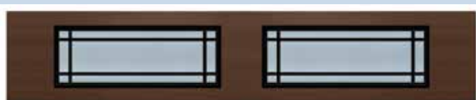
Satin Texture Glass & Regal Wide Black Muntin Bars