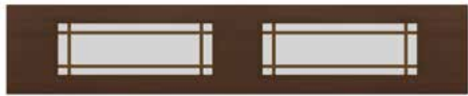
Regal Wide Bronze Muntin Bars