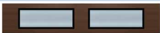
Satin Texture Sealed Glass