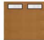
Top Section 38" x 14" or 26" x 14"

Note: Bottom section window will only be installed on the top of the section.