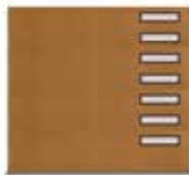
Full Section Stacked