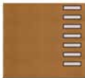
Right Stacked Vertical Column 24" x 6"