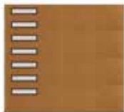
Left Stacked Vertical Column 24" x 6"