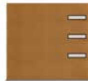
Bottom Section Stacked